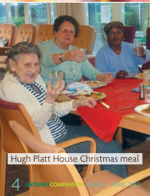
Hugh Platt House Christmas meal